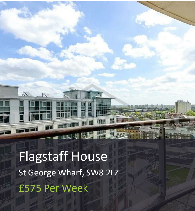
Flagstaff House St George Wharf, SW8 2LZ £575 Per Week