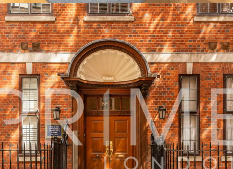
Gough House, 6 Bolt Court, London, EC4A 3DQ £955,000