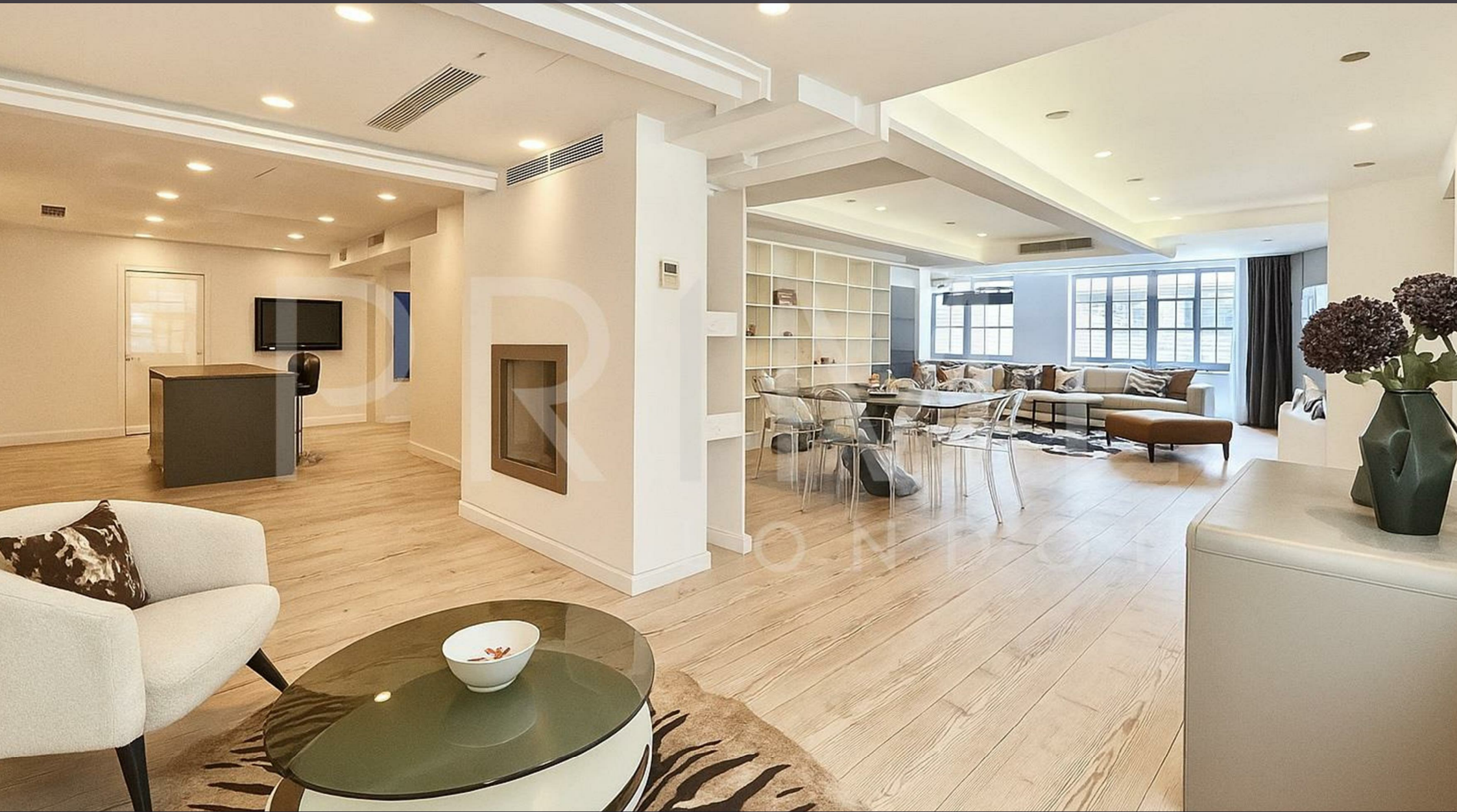
The Regent Lofts, Soho, W1F 7BE