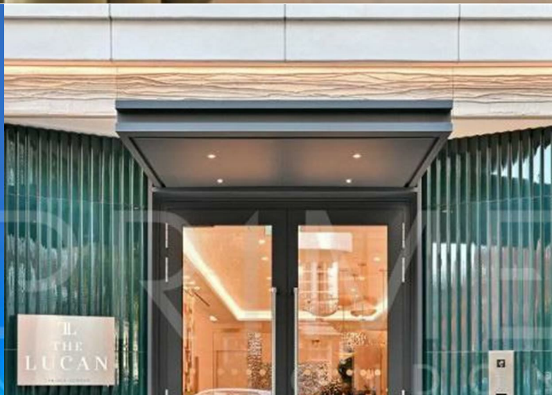
The Lucan Chelsea, SW3 3PQ £2,150,000